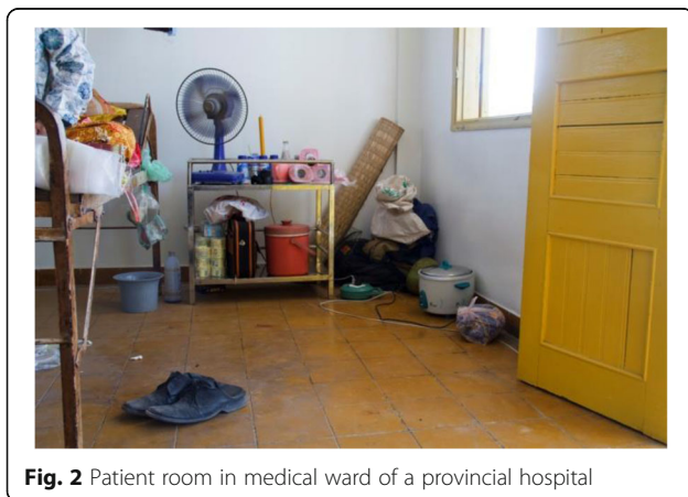
Fig. 2 Patient room in medical ward of a provincial hospital

“We often prescribe for prevention. When we prescribe, we don’t know whether disease is cured by antibiotics or